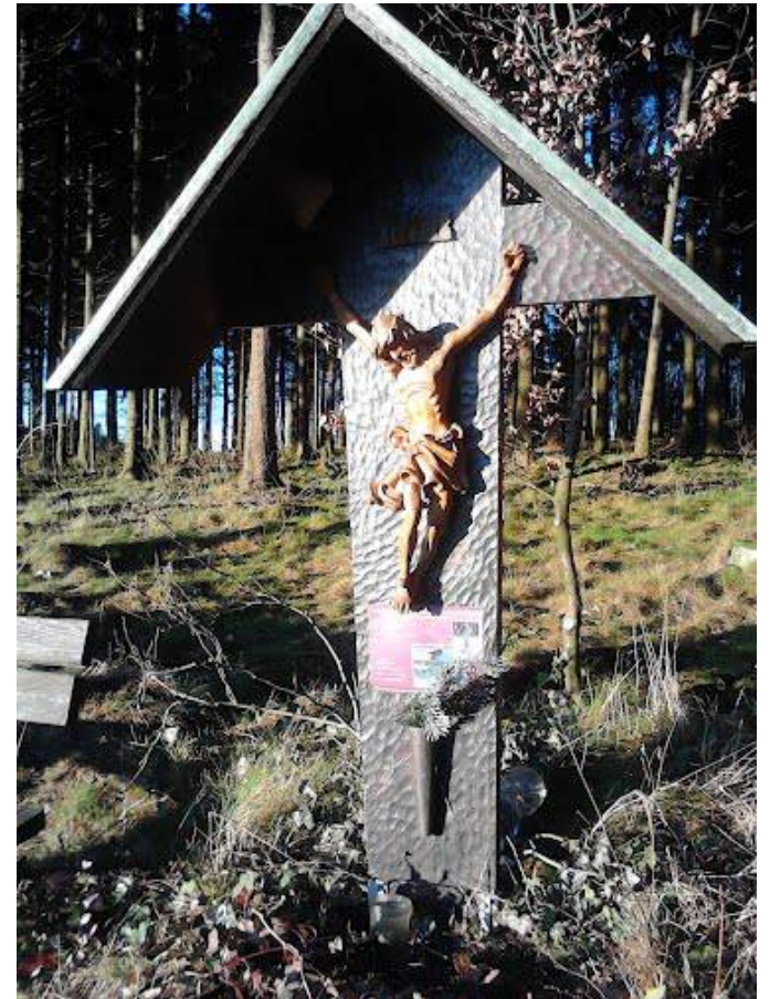
Pic-2, 2.3 km