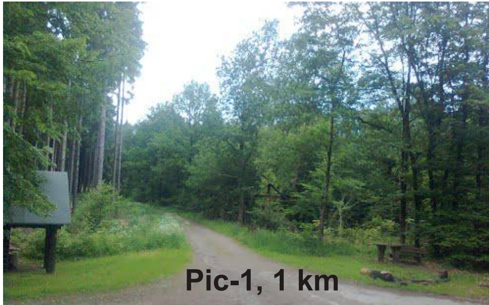
Pic-1, 1 km