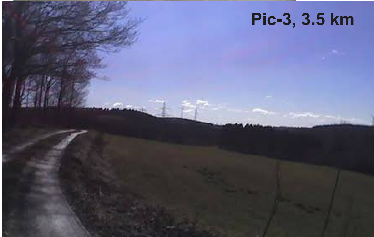
Pic-3, 3.5 km