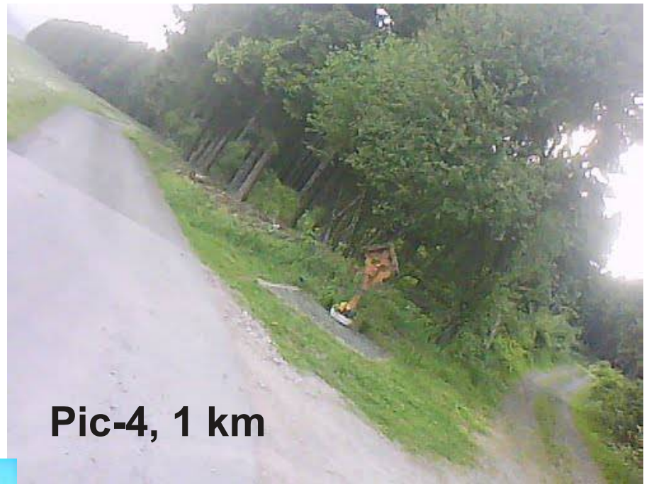
Pic-4, 1 km