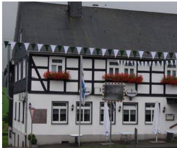
Pic-5, 1.6 km